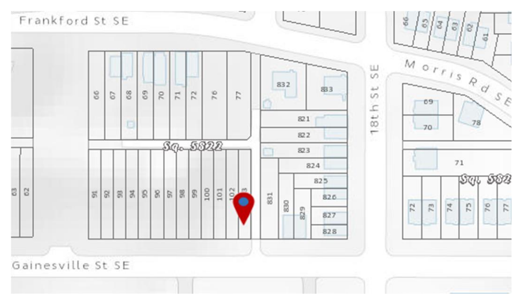
Figure 1. Location Map for 1724 Gainesville ST SE (Lot 103)